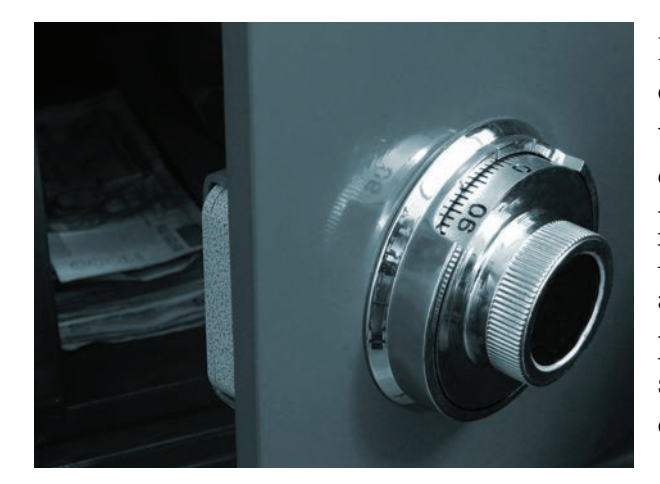
An adequate amount of disability income insurance is like having hundreds of thousands of dollars locked up in a wall safe, ready to use in the event of a disability.

Long Term Disability plans set out with this goal in mind, but these types of plans have a benefit cap which means that higher paid employees or owners will often receive less than 65%. The higher the income, the lower the percentage of income covered! This is referred to as reverse discrimination. Individual disability plans available from the traditional carriers start off insuring around 65% of income, but as income goes up, the percentage of income covered goes down.