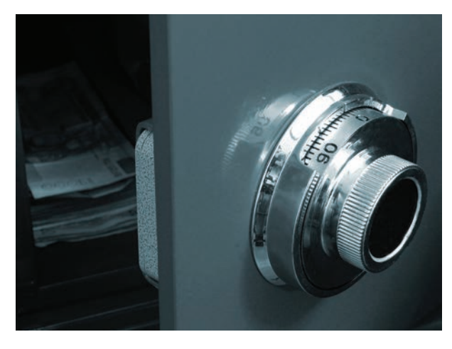
An adequate amount of disability income insurance is like having hundreds of thousands of dollars locked up in a wall safe, ready to use in the event of a disability.

Long Term Disability plans set out with this goal in mind, but these types of plans have a benefit cap which means that higher paid employees or owners will often receive less than 65%. The higher the income, the lower the percentage of income covered! This is referred to as reverse discrimination. Individual disability plans available from the traditional carriers start off insuring around 65% of income, but as income goes up, the percentage of income covered goes down.