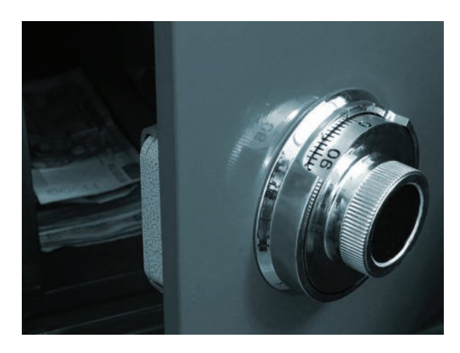
An adequate amount of disability income insurance is like having hundreds of thousands of dollars locked up in a wall safe, ready to use in the event of a disability.

Long Term Disability plans set out with this goal in mind, but these types of plans have a benefit cap which means that higher paid employees or owners will often receive less than 65%. The higher the income, the lower the percentage of income covered! This is referred to as reverse discrimination. Individual disability plans available from the traditional carriers start off insuring around 65% of income, but as income goes up, the percentage of income covered goes down.